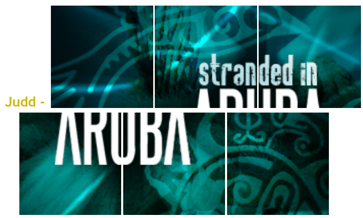
Rafe - Judd, you are so much faster than I am.

just gotta figure out the links and img tags.