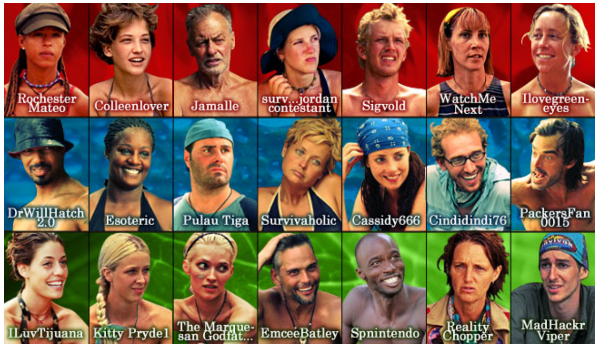
The Arena, Day 9

The castaways receive news about their next challenge and suspect a twist.